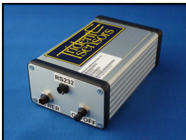
Universal Ship's Deck Unit