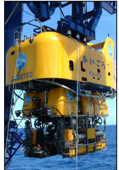
Full ocean depth operations, anywhere in the world