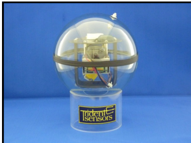
The Challenger Deep Beacon & Data Communications System